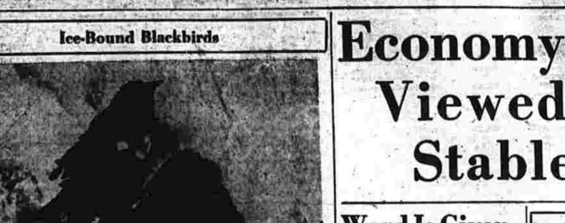
An ice plot is used to free these blackbirds encased in ice at Lake Overhills, Oklahoma City. More than 100 birds were trapped when they came down on the ice during a rain storm only to be caught by a sudden freeze.